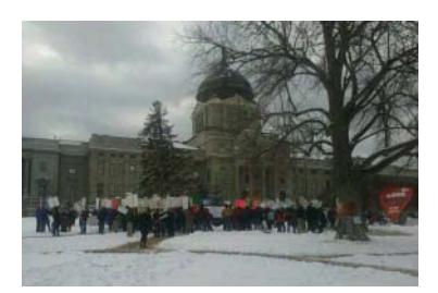
Conservationists gathered in February for the Rally for the Love of Montana.