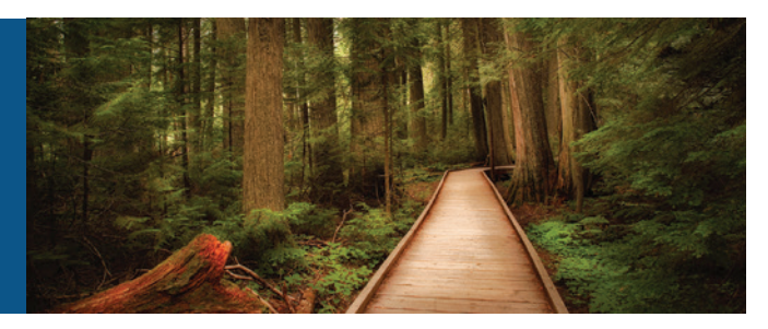
Montana Conservation Voters is a 501(c)4 nonprofit organization, and membership dues and contributions are not tax-deductible. Tax-deductible contributions may be made to the MCV Education Fund, a 501(c)3 nonprofit organization. Visit mtvotersedfund.org for more information.

Send your donation via the enclosed envelope or visit our website: mtvoters.org/donate