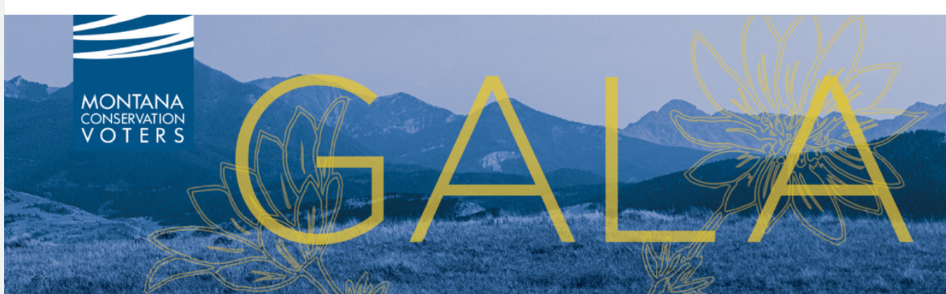
Photo: Whitney and her family in Beehive Basin near Big Sky, Montana

Get your tickets today for MCV's Gala in Livingston on October 6 from 5PM to 8PM!