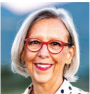
Mayor: Cyndy Andrus (Incumbent)