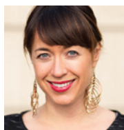
Ward 5: Lynn-Wood Fields