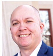
Mayor: Casey Schreiner