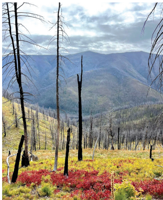
A view of some of the areas that would be protected by the Blackfoot Clearwater Stewardship Act.

MSCA: The bill has little support among Montanans. A 2022 voter survey found that only 6% of Montanans supported eliminating protections from Wilderness Study Areas.